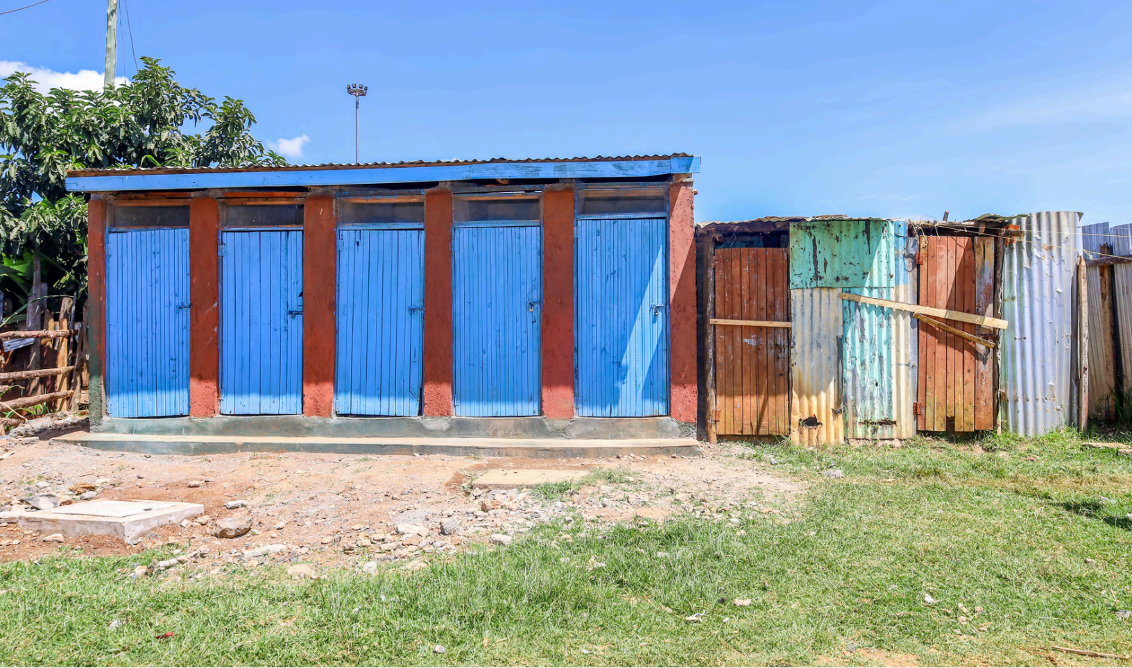
"From makeshift to modern: A glimpse of transformation through UBSUP. Before, an unsafe and unhygienic structure; after, a safe, eco-friendly, and dignified sanitation facility.

As part of its mandate to provide equitable sanitation services, ELDOWAS is currently implementing the Upscaling Basic Sanitation for the Urban Poor (UBSUP) project in Langas. Funded by the Water Sector Trust Fund (WSTF) and the Bill & Melinda Gates Foundation, this project aims to provide over 300 households with safe and affordable sanitation facilities.